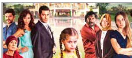
ELIF Ponedjeljak - Petak 20:00h