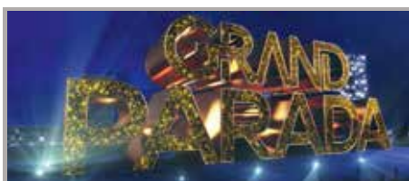
GRAND PARADA Utorak, 21:00h